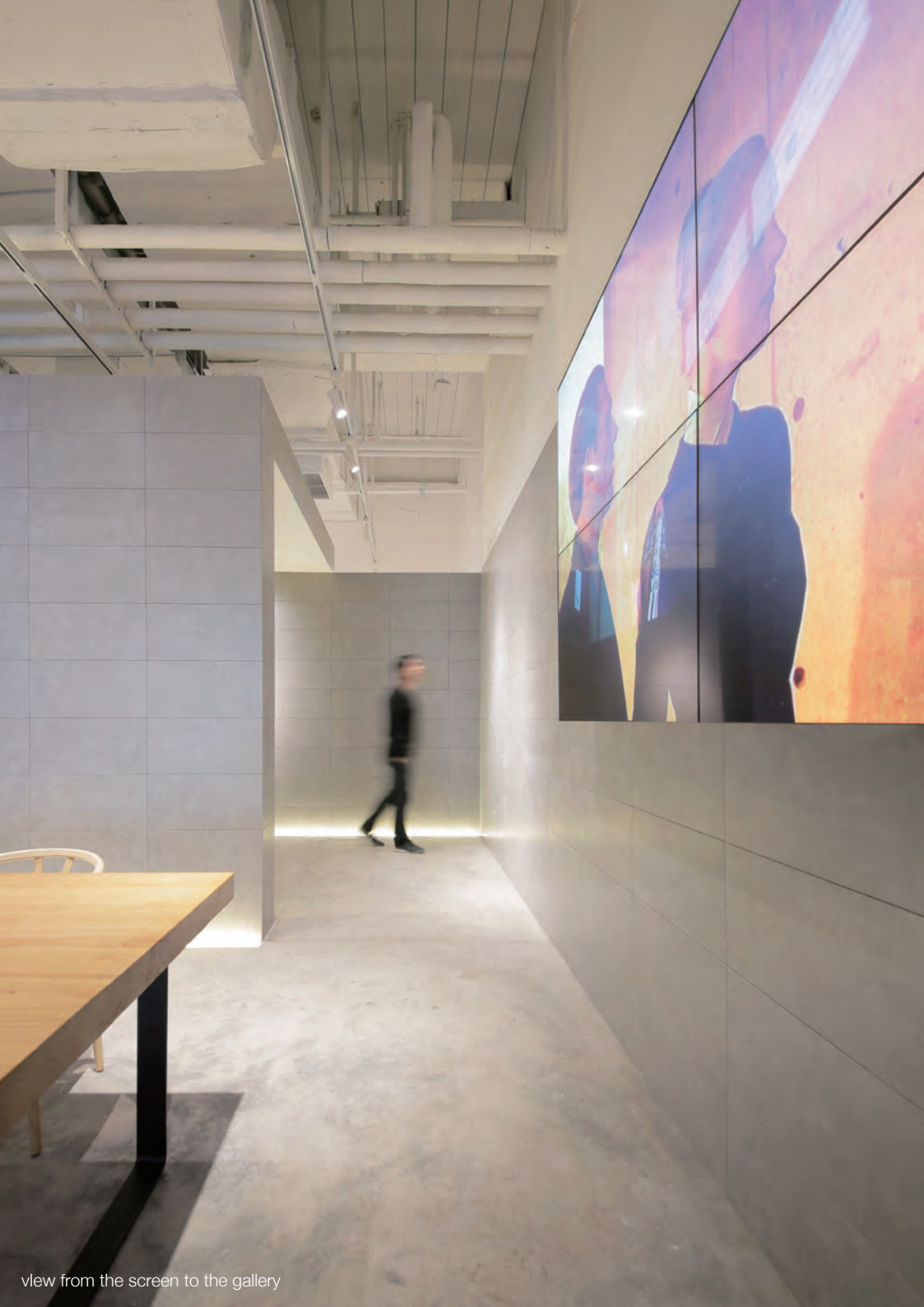
view from the screen to the gallery