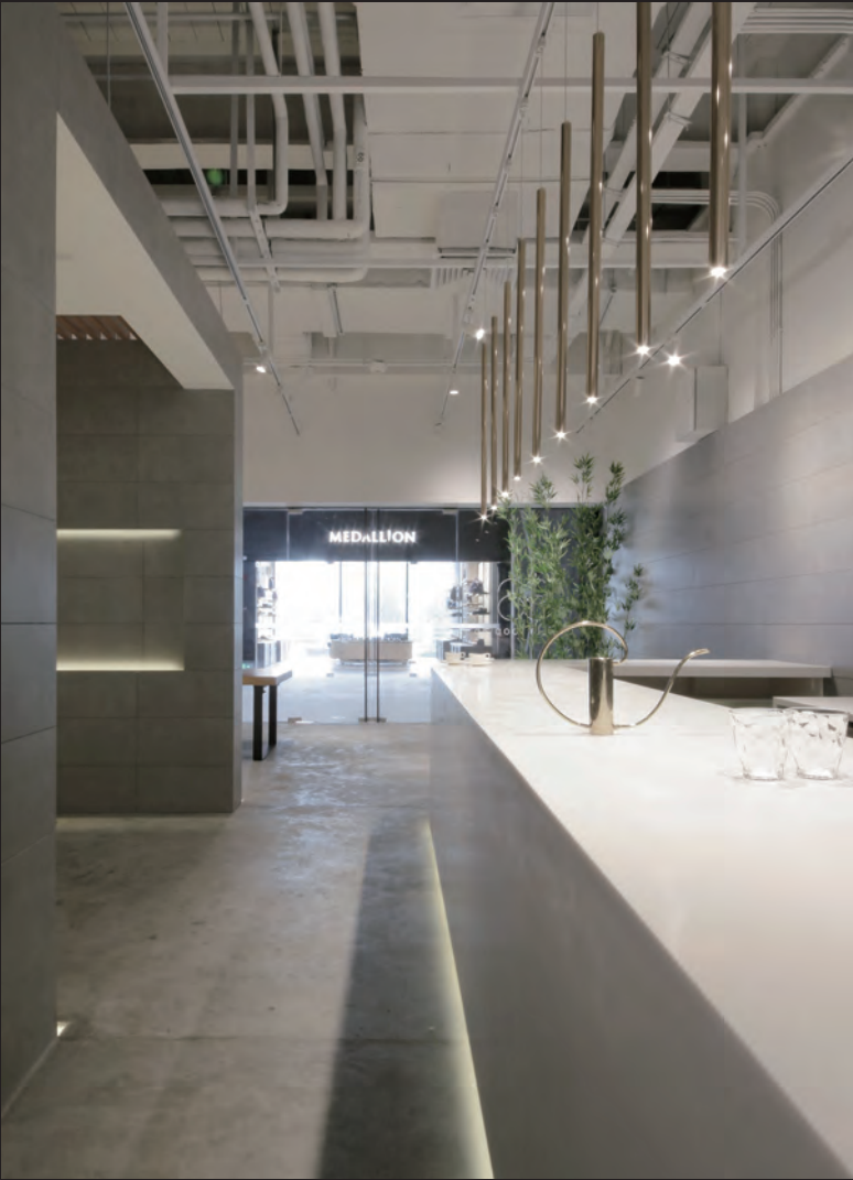
Indirect lighting effects