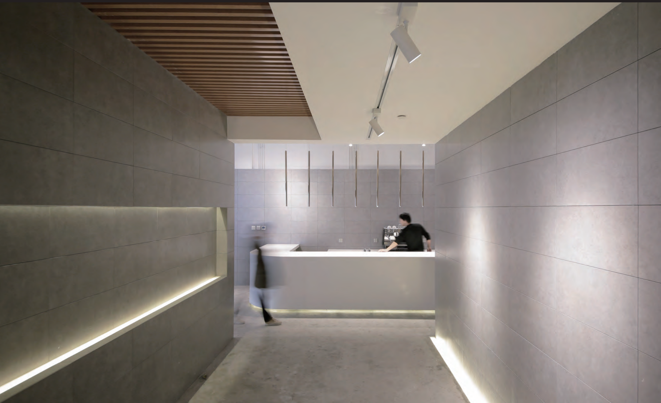
view from the gallery