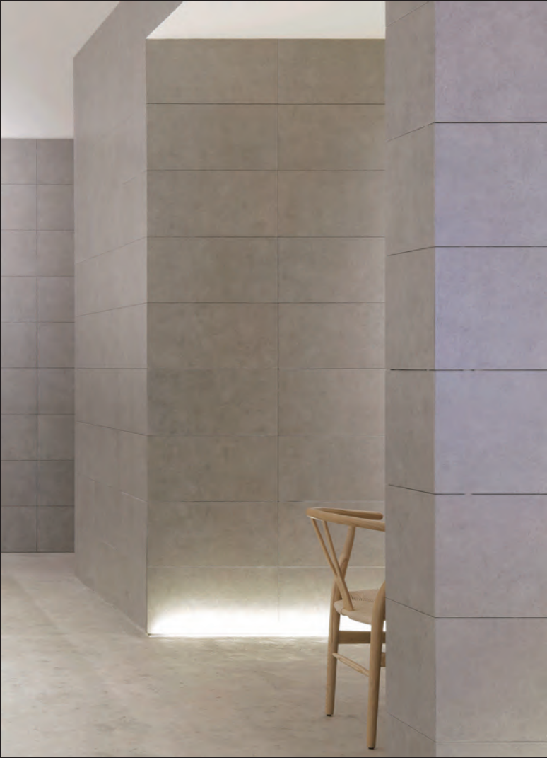
palette of monochrome and wooden texture