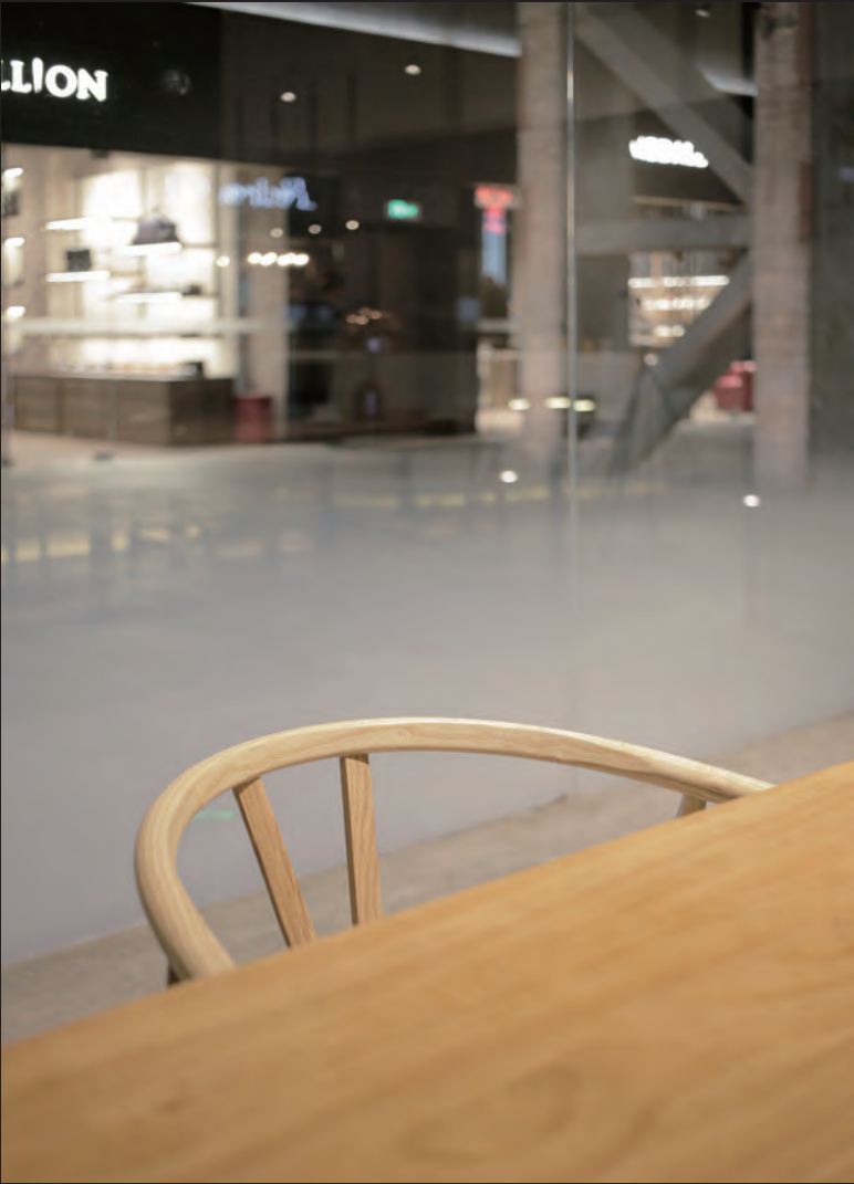
view from the inside