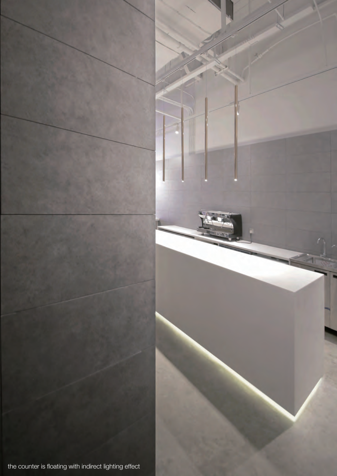
the counter is floating with indirect lighting effect