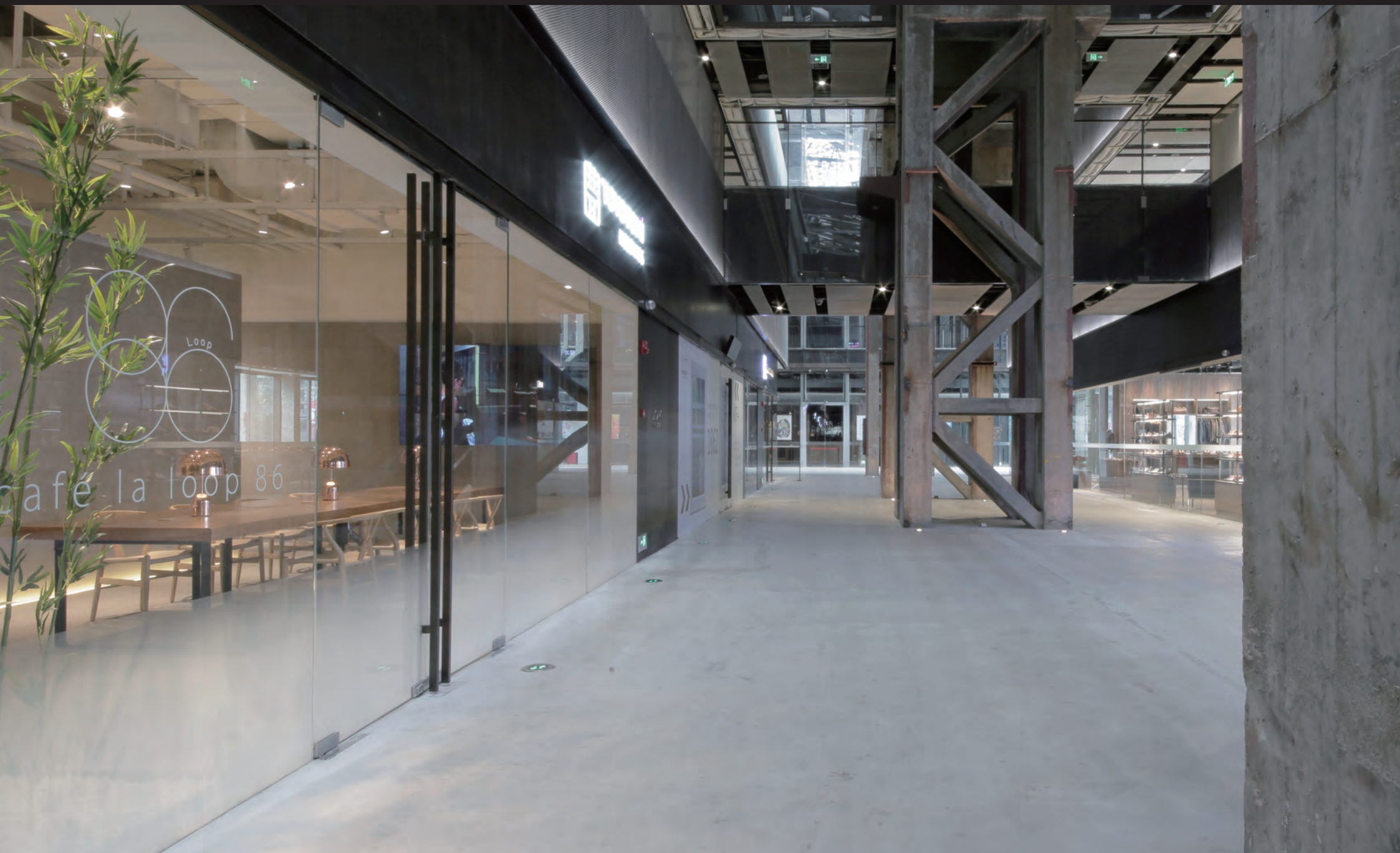
view from the concourse