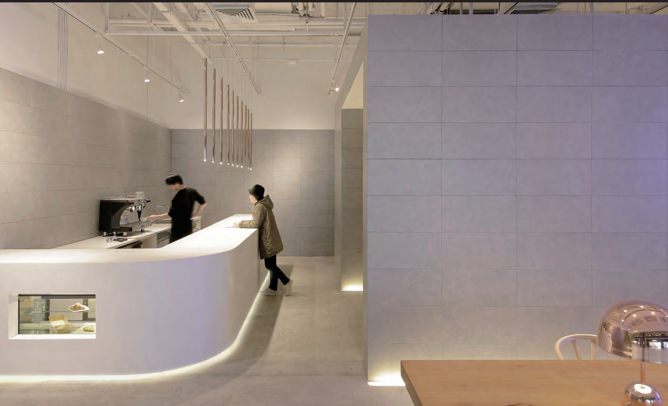
view from the hall