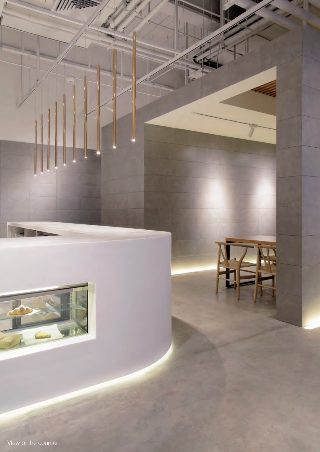
View of the counter