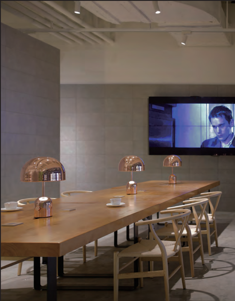
view of from the entrance