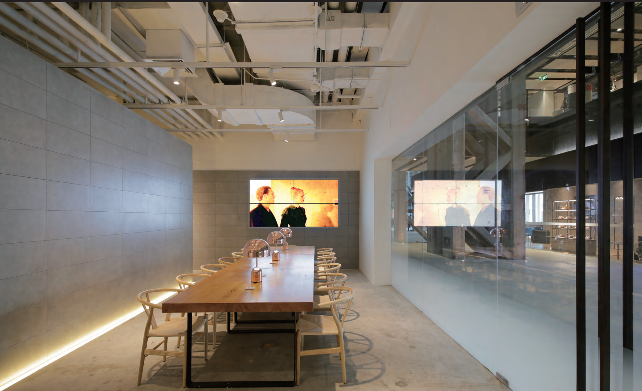
view from the hall