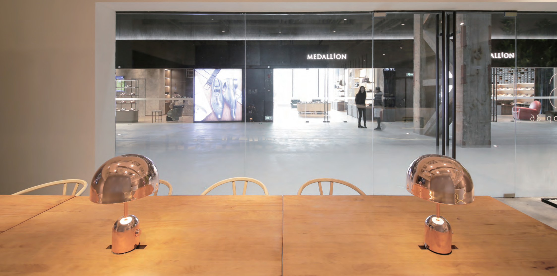
view from the inside