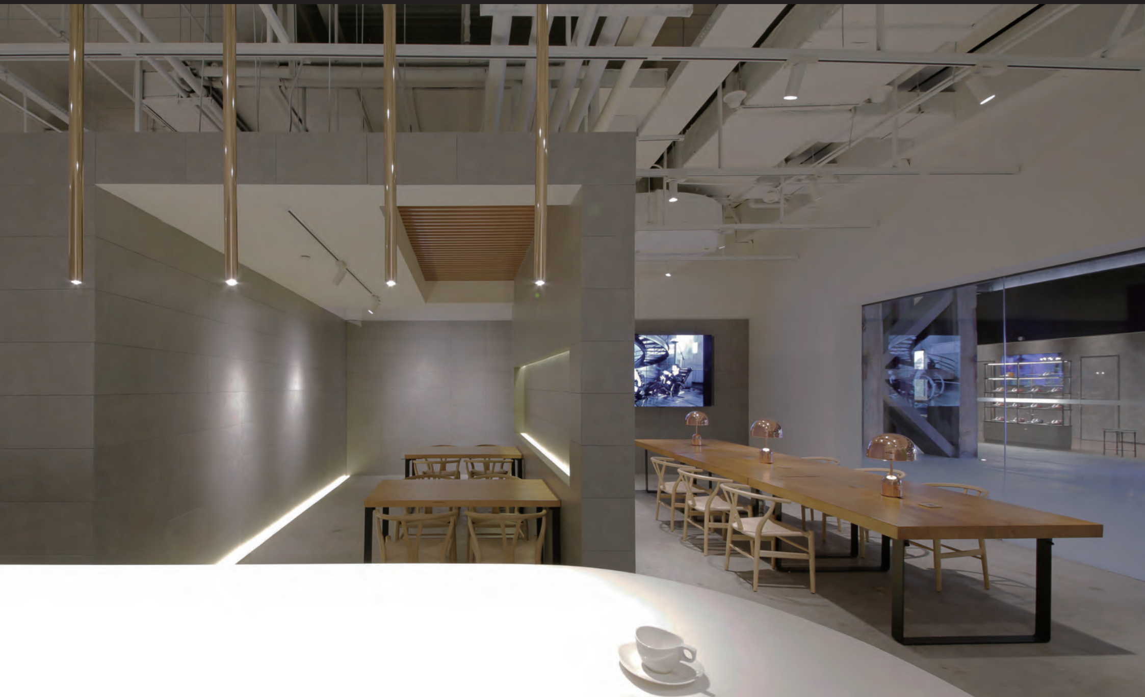
view of the gallery and cafe from the kitchen