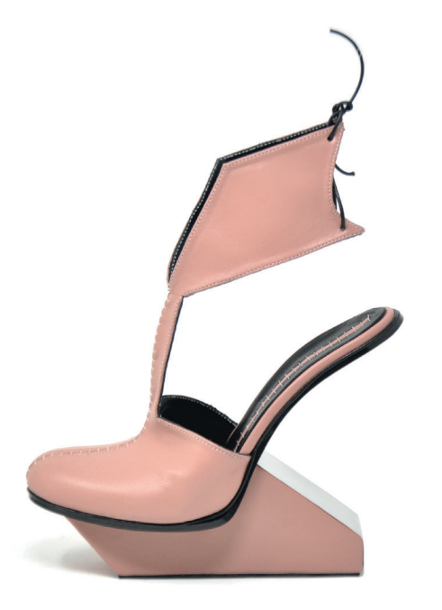
Synchronicity SYNC 6