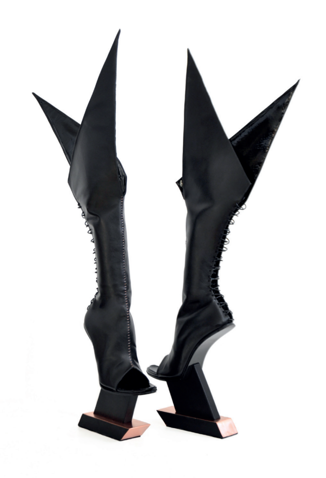
Synchronicity SYNC 4