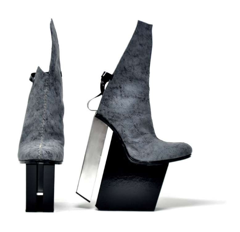
Synchronicity SYNC 3