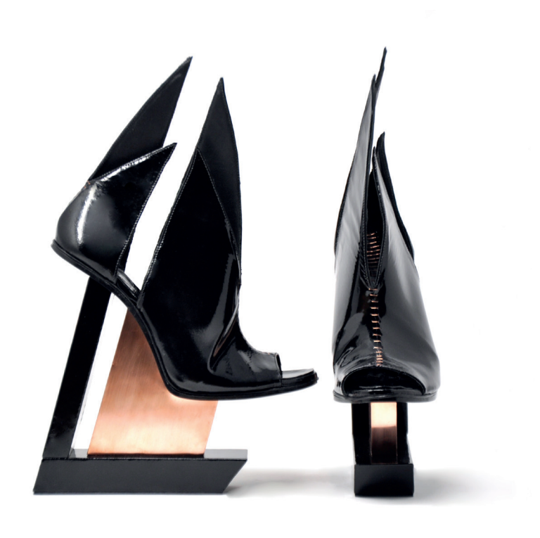
Synchronicity SYNC 5