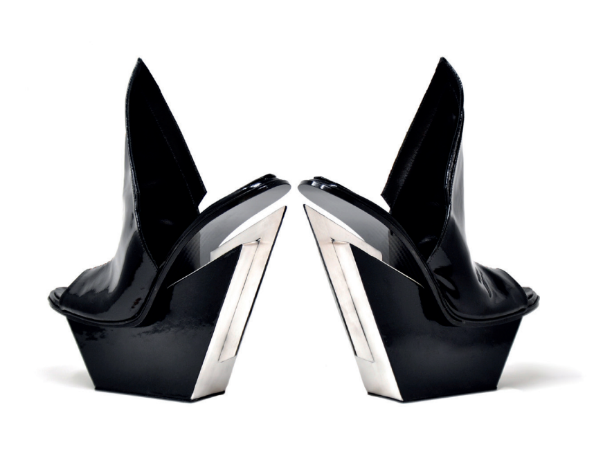
Synchronicity SYNC 7